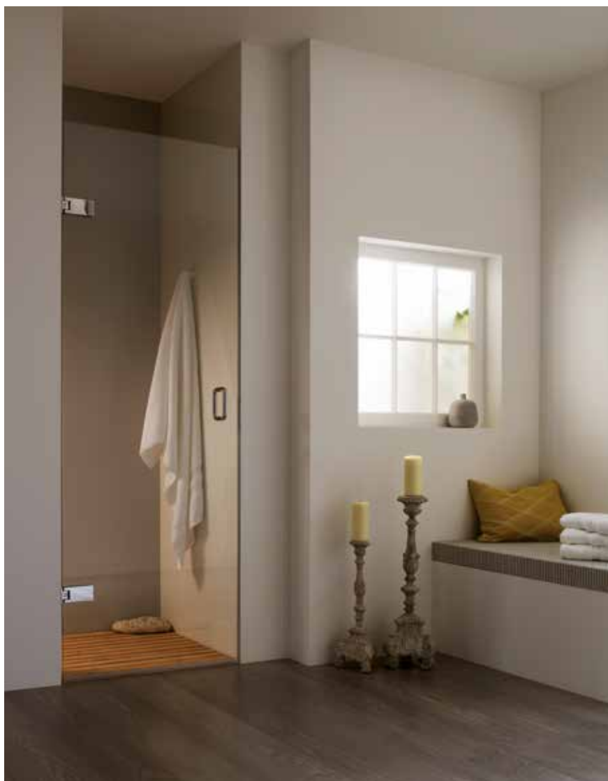
Pictured with Bespoke hinge, Standard Maine will be supplied with our Standard hinge For further details on Frameless fittings, please see page 87